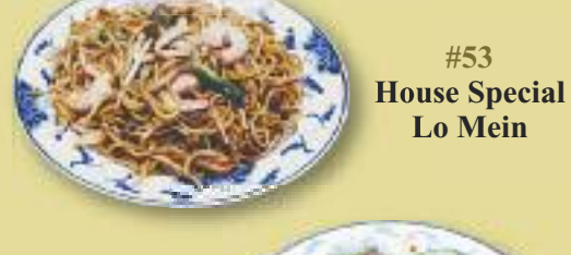
#53 House Special Lo Mein