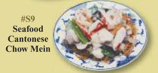
#S9 Seafood Cantonese Chow Mein