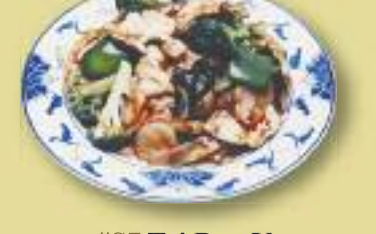
#S7 Tai Dop Voy