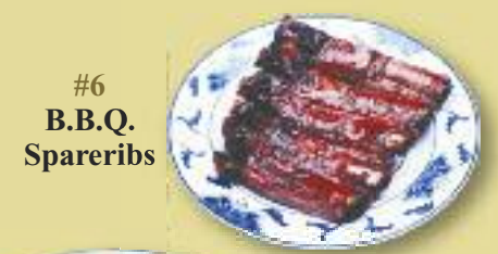
#6 B.B.Q. Spareribs

Hot & spicy can be adjusted upon request ★ popular 🔥 hot & spicy Prices subject to change without notice