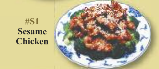
#S1 Sesame Chicken