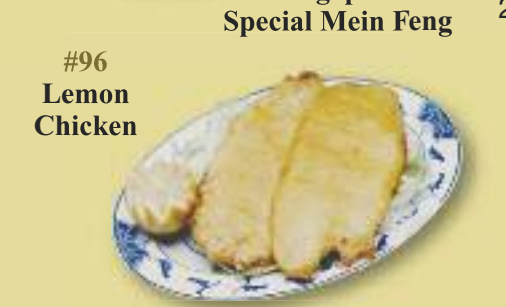
#96 Lemon Chicken