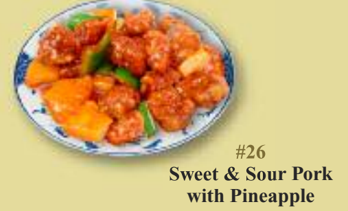
#26 Sweet & Sour Pork with Pineapple