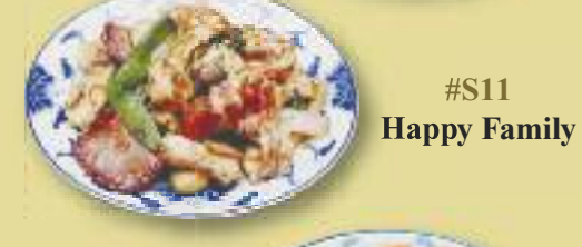
#S11 Happy Family