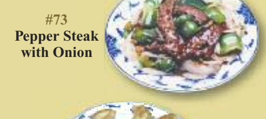
#73 Pepper Steak with Onion