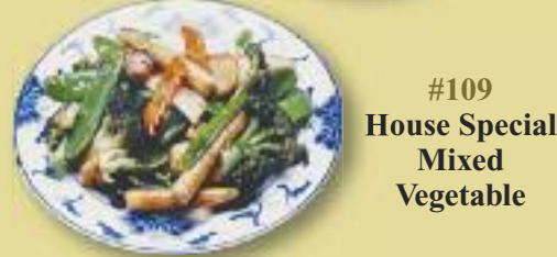
#109 House Special Mixed Vegetable