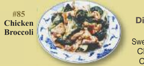
#85 Chicken Broccoli