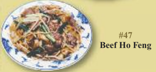
#47 Beef Ho Feng