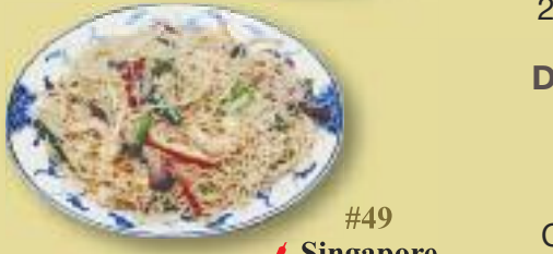
#49 Singapore Special Mein Feng