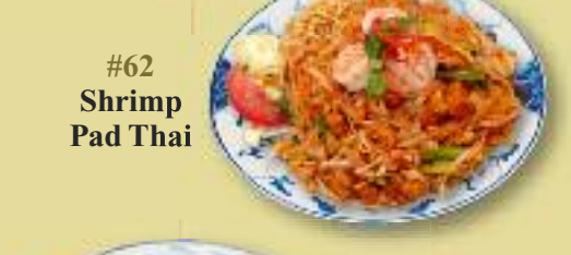
#62 Shrimp Pad Thai