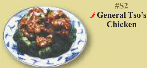
#S2 General Tso's Chicken